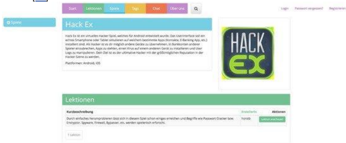
Figure 1. Entry for the game “Hack Ex” in the Sparkling Games database.

use tags to organize the topics in question. This is similar to how learning games have been analysed academically using the learning mechanics–game mechanics (LM-GM) framework [34].